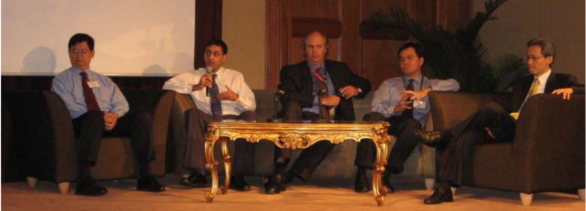
Semicon Summit 2007